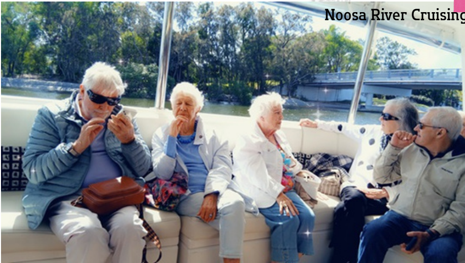
Noosa River Cruising