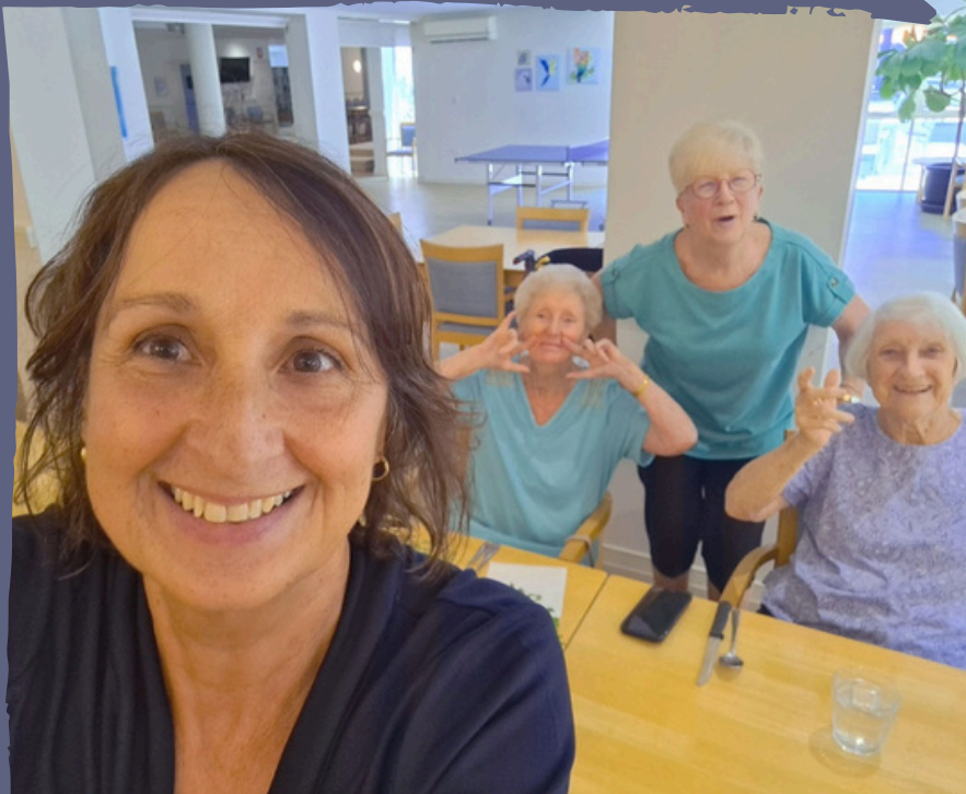
The girls photo-bombing my selfie - RUDE!

Pretty sure you all know who I am. I'm the LOUD administration person!