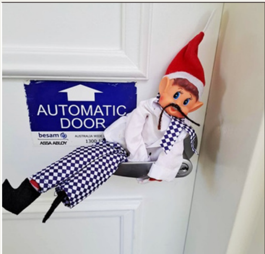
LET ME INNNNNNNN!!!!!!