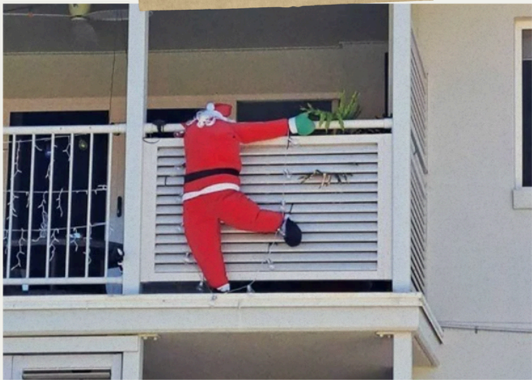
'%$#@* Whatever happened to good old chimneys!