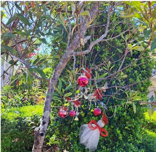
Fairy garden in a tree!